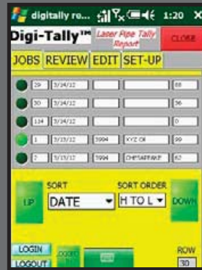
Job file review screen