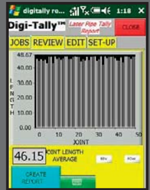
Auto check review screen